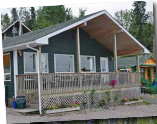
Bear Hunt accommodations

This combined with Howey Bay Resort providing excellent facilities, equipment, service and having expert and personable guides available, has resulted in our guests having truly memorable experiences.