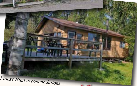
Moose Hunt accommodations